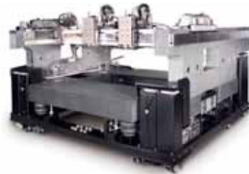
◀ Figure 2 : X-Y Gantry for Generation 6 and 7 with Dual Heads