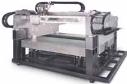
◀ Figure 1 : X-Y Gantry for Generation 6 and 7

The glass is stationary, with the “tool” moving over the glass in the X and Y axes.