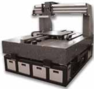
◀ Figure 3 : X-Y Split Axis Positioner

The glass moves in one direction, while the “tool” moves in the orthogonal direction over the glass.