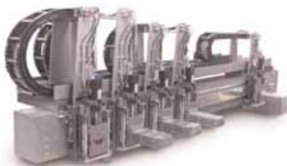
◀ Figure 7 : Generation 6 System can be disassembled for shipping