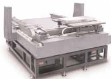
◀ Figure 6 : X-Y Planar for Generation 6