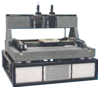
◀ Figure 5 : Planar X-Y Stage with Bridge

The glass moves in both the X and Y axes, typically underneath a stationary bridge that supports the tool.